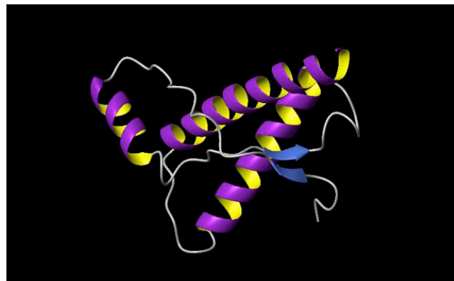
Fig. 1: The three dimensional structure of the intact bovine cellular prion protein