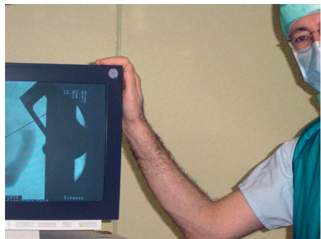
Fig. 2 Inter-operative control of the electrode with image converter, conductor, transducer

The cerebral pacemaker produces an improvement